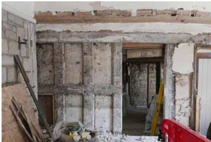
An internal view of works at Cardynham House -. The approved work aims to restore the building to its original dwelling plan.