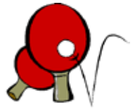
Table Tennis starts again on Wednesday 15th September, 7.00 to 9.00pm in the Beacon Hall at the Centre. Price still £5.00 only when you play.

The club supplies tables, nets, bats and balls. You supply sports or soft shoes, a sense of humour and a willingness to have some fun. Please do come and join us in this hand/eye co-ordination exercise and get fit at the same time.