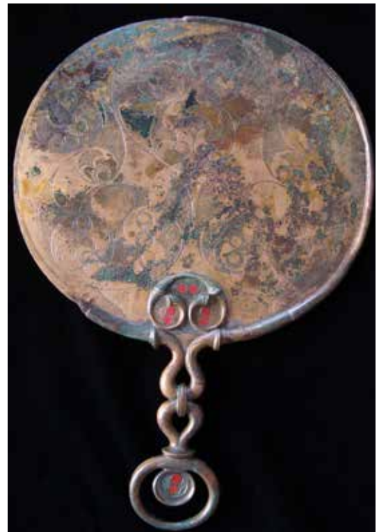
The decorated side of the Birdlip mirror