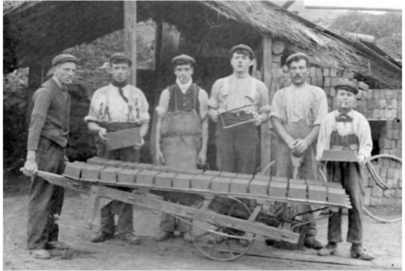
A small brickworks in Essex, c1901