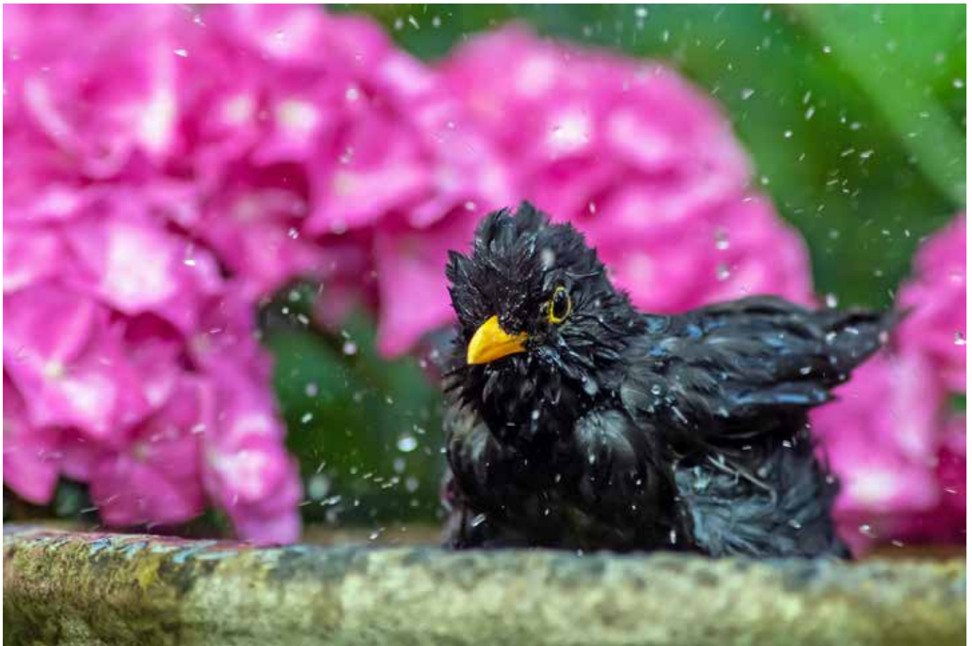
Making a splash: Pete Llewellyn captured this male blackbird in his garden on the bird's almost daily visit for a bath.