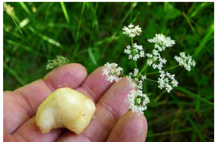
A pignut (after cleaning)

The other morning on going to see our cattle, I stopped my truck by the gate to the field and stepped out next to a bank of Fullers earth. I noticed a small hole had been dug and surrounding this was a small heap of soil. I counted more than sixty such holes, some with small bees hovering around. I am told that this is a species of ground bee which digs a hole, lays an egg and adds some pollen/nectar before sealing it. We recognise Bumblebees, but there are more than 250 species of bees in the country, of which only 24 are bumblebees. They are all important for pollinating our crop foods. When growing tomatoes in greenhouses became commercial in Spain, growers hand pollinated the flowers, but this was very labour intensive. They now buy in hives of bees to put in the greenhouses to do the job. Insects are essential for food, particularly fruit, production. If numbers continue to decline because of the use of chemicals, we will not be able to produce food to eat or seed to grow future crops.