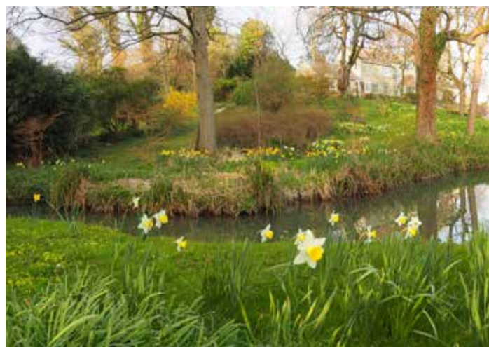
Daffodils by the Painswick Stream