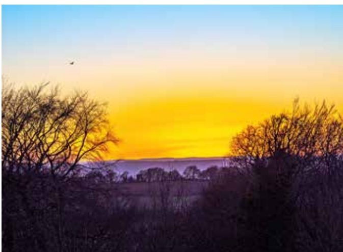
Sunset from Painswick Beacon with dust from the Sahara

We now have 14 unique and eye-catching signs that we hope will make the drivers through Painswick think about their speed. See page 8 for more details