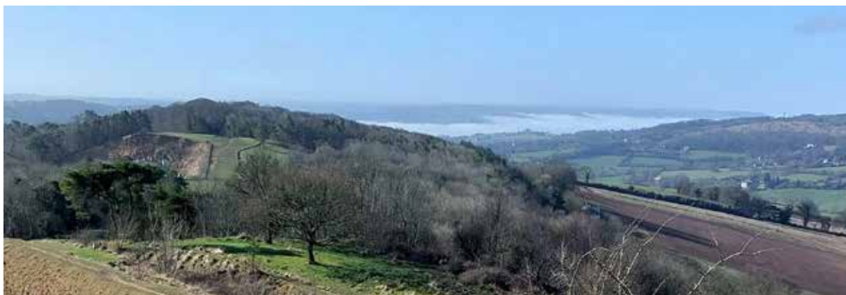
View of fog down in the Painswick Valley

The Beacon welcomes photographs reflecting scenes and events around Painswick to be considered for publication as space dictates. These pictures were taken by members of the Beacon team