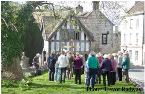
The traditional procession of witness with the cross took place on Good Friday as usual.