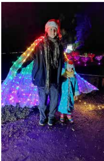
In the Christmas Spirit at the entrance to the Rococo Garden.